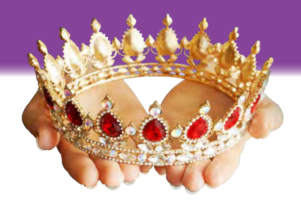
For Such a Time as This