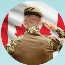
Veteran (identity unknown)